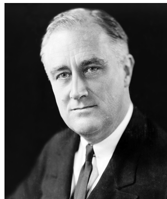
Franklin D. Roosevelt

“I cannot over-emphasize the importance of phosphorus not only to agriculture and soil conservation but also to the physical health and economic security of the people of the nation.”